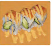
* Mt. Helen