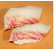
* Red Snapper