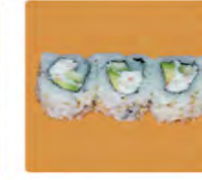
Crab Salad Roll