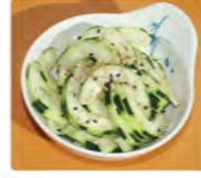
* Cucumber Salad