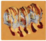
* Alaska Roll