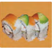
* Oregon Roll