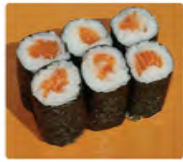
* Salmon Roll