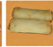
* Spring Roll