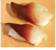
* Surf Clam