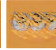
* Spicy Salmon Roll