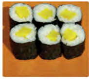
* Yellow Radish