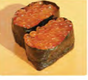
* Salmon Roe