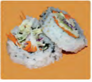
* Veggie Roll