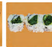
* Seaweed Roll