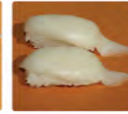
* White Tuna