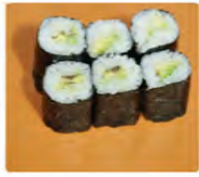
* Avocado Roll