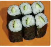
* Cucumber Roll