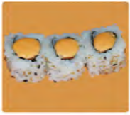
* Spicy Tuna