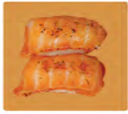
* Cajun Salmon