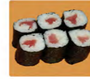
* Tuna Roll